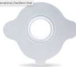
Products International, FlexBore®