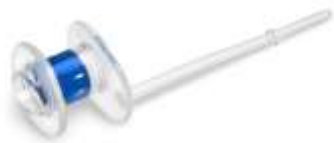
Provox Vega available in 17Fr, 20Fr and 22.5Fr