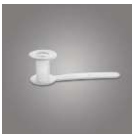
Classic indwelling available in 16Fr and 20Fr