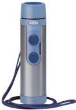
Servox (Main Medical)