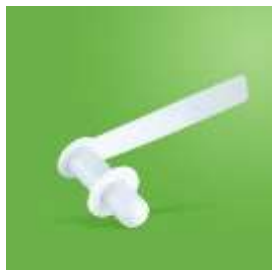
Duckbill available in 16Fr only