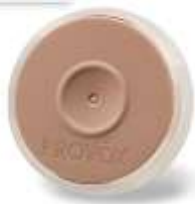
Phoson® X7044511® HME