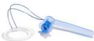
Non-indwelling available in 17Fr and 20Fr