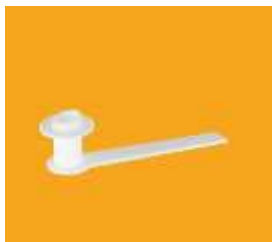
Low pressure voice prosthesis available in 16Fr and 20Fr